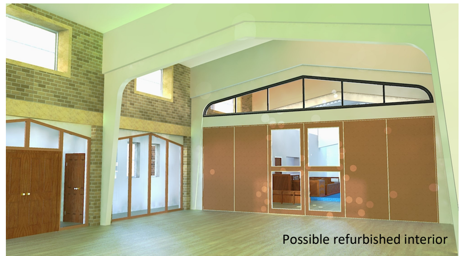
Possible refurbished interior